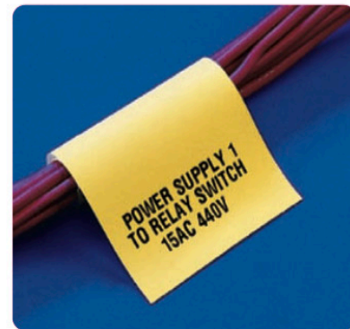
B-437 Yellow Tedlar in aerospace applications provides permanent identification of wire bundles.